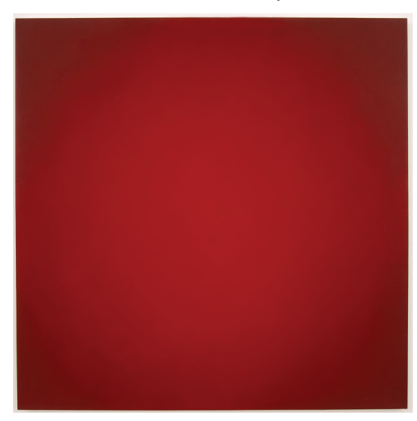
Red Green #4 "Siren" 1998, oil on canvas, 36" x 36"

her colors may be—whatever their "temperature," to use her terms—one doesn't exactly warm up to them or feel cooled down by them. They arouse neither empathy nor indifference, but a certain calm pleasure. One instantly perceives their universality, that is, their exquisitely "mediated simplicity," which is what Hegel called the "universality" of the here-and-now. Their fine-tuned universality affords a sensation of sublimity. At the same time, the sense of the ineffably