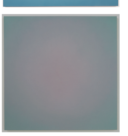
Red Green #5 "Sweet" 1998, oil on canvas, 36" x 36"